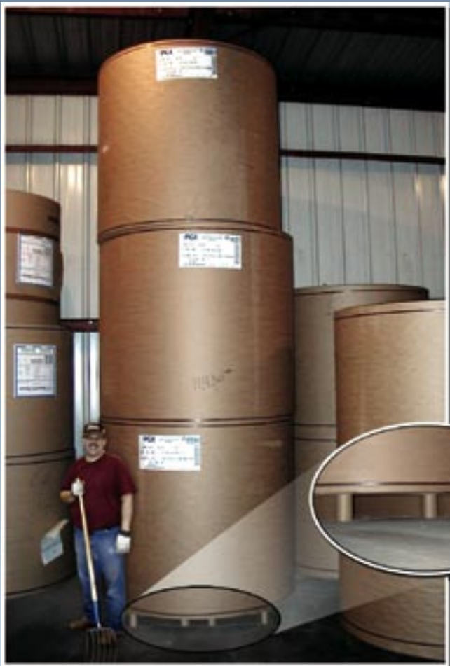
10,000 lb. Static Load Test ▲

The PennyPincher Pallet™ is practical in every way. The standard 48" x 40" pallet weighs approximately ten to eleven pounds, and may be customized to your requirements. Since a PennyPincher pallet is less rigid than a wooden pallet, it will not damage expensive auto-palletizing equipment. The PennyPincher Pallet™ has 100% top deck coverage, so nothing will slip through the cracks.