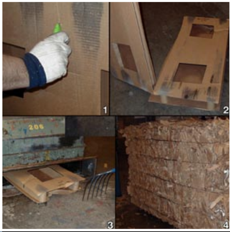
Breaking down a PennyPincher Pallet™ for recycling ▲