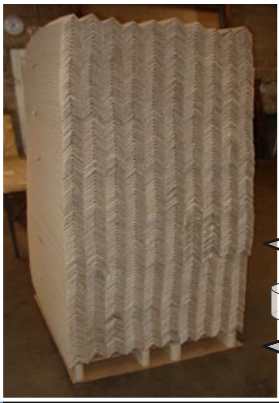
A loaded pallet prepared for shipping ▲

We have always attempted to be on the leading edge of developing new and innovative corrugated products. When our customers' requested an improved pallet, we developed the PennyPincher Pallet.™ Our first corrugated pallet was developed in 1997. Since then, it has gone through five major revisions to the superior final product. These corrugated pallets are designed and developed by our internal specialists here at the St. Marys Box Company, who have 115 years of combined experience.