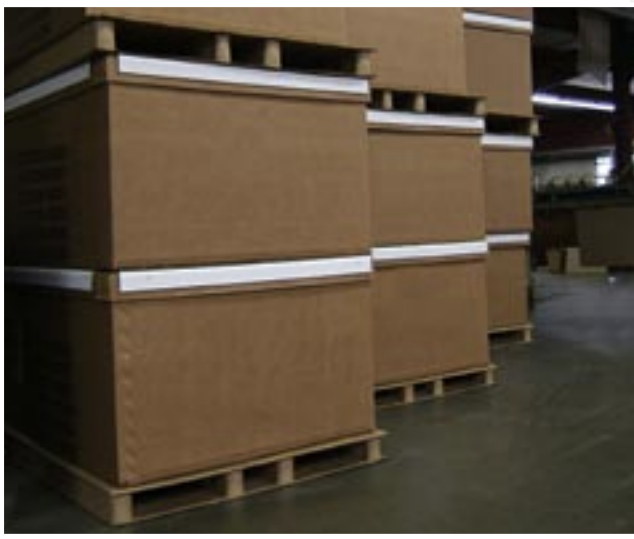
▼ Clean appearance

We would like the PennyPincher Pallet™ to be your primary pallet. That is why we have designed it to be versatile and customizable. At 3.5 inches high, the PennyPincher Pallet™ reduces your storage area for pallets. The pallet can be customized to your product's size or weight, by adjusting the deck materials. The runners can be modified for 4-way access, and banding slots can be added. Floor jack holes are also an option, making this pallet customizable to any application. The clean lines of the pallet make it a perfect fit for Point-of-Purchase Displays.