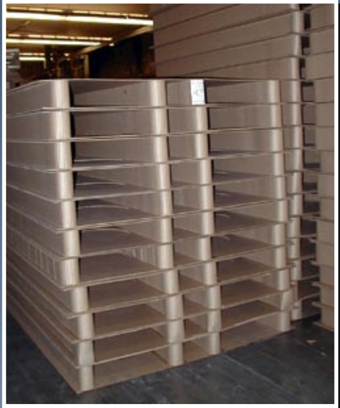
▼ Pallets ready for shipment

Since October of 2001, many overseas countries, in addition to the European Union have enacted regulations impacting the use of non-manufactured wood packing materials. These regulations are designed to control the spread of foreign insects. Corrugated pallets have an obvious advantage when it comes to these wood-borne pests. The pallets do not provide a habitat or food source for pests that eat or burrow into wood. As such, they do not require specialized treatment for export.