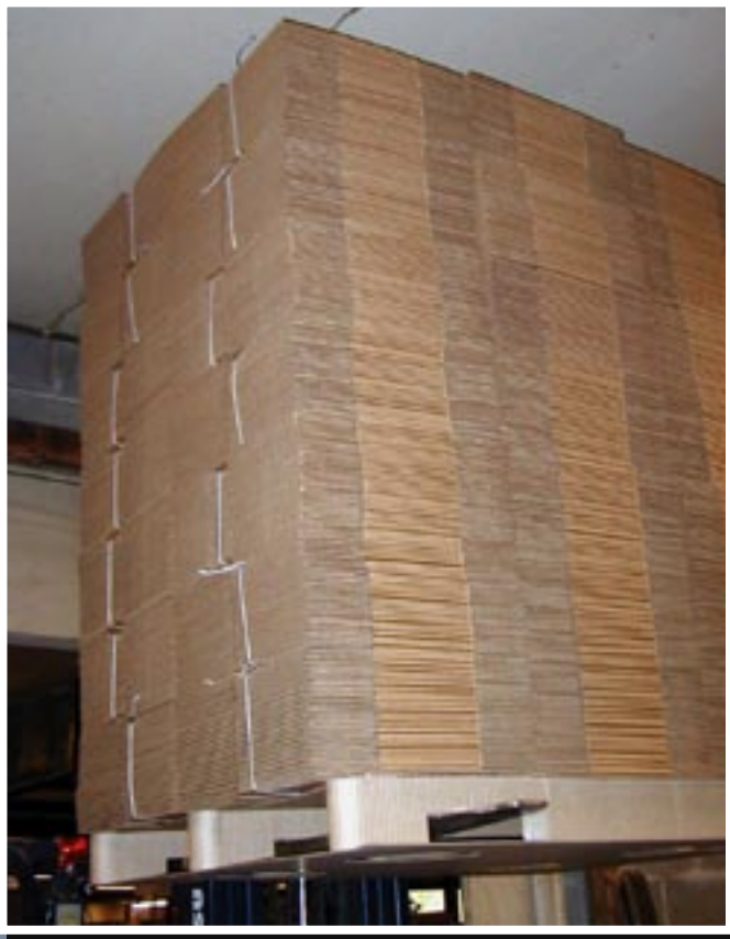
◀ Our 4-Way modification