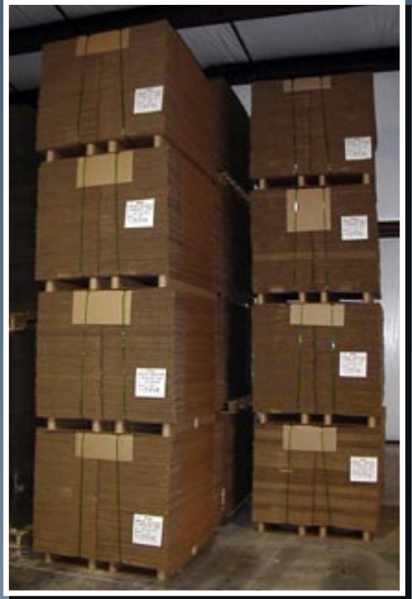
Multi-Tier Stacking ▼